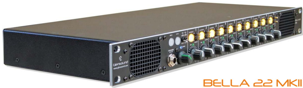
BELLA 22 MKII